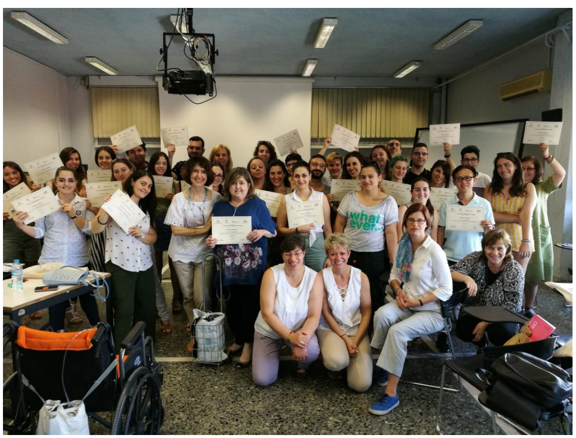
Summer School 2018 Graduation

Please check the bios of our Summer School instructors: <a href="http://www.enl.auth.gr/summerschool/2018-amlit/instructors.html">http://www.enl.auth.gr/summerschool/2018-amlit/instructors.html</a>