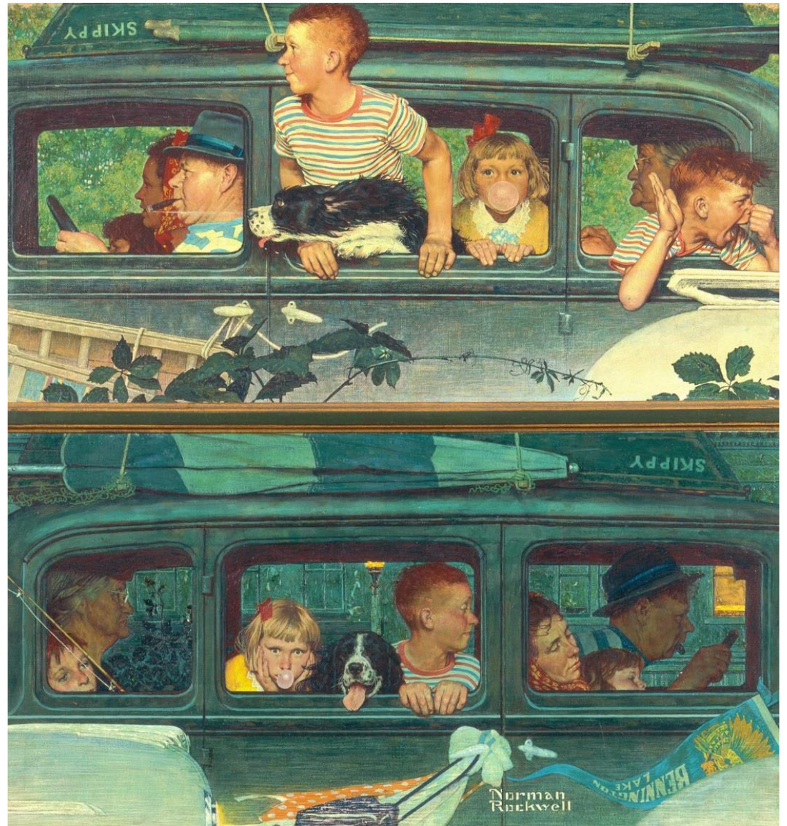
Norman Rockwell, "Going and Coming," 1947