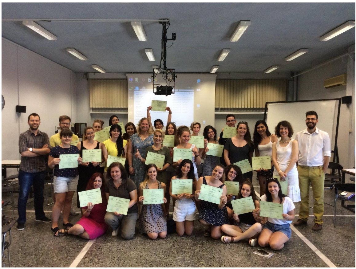
Participants receive their certificates