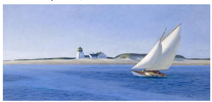
Edward Hopper, The Long Leg (1935) at www.huntington.org