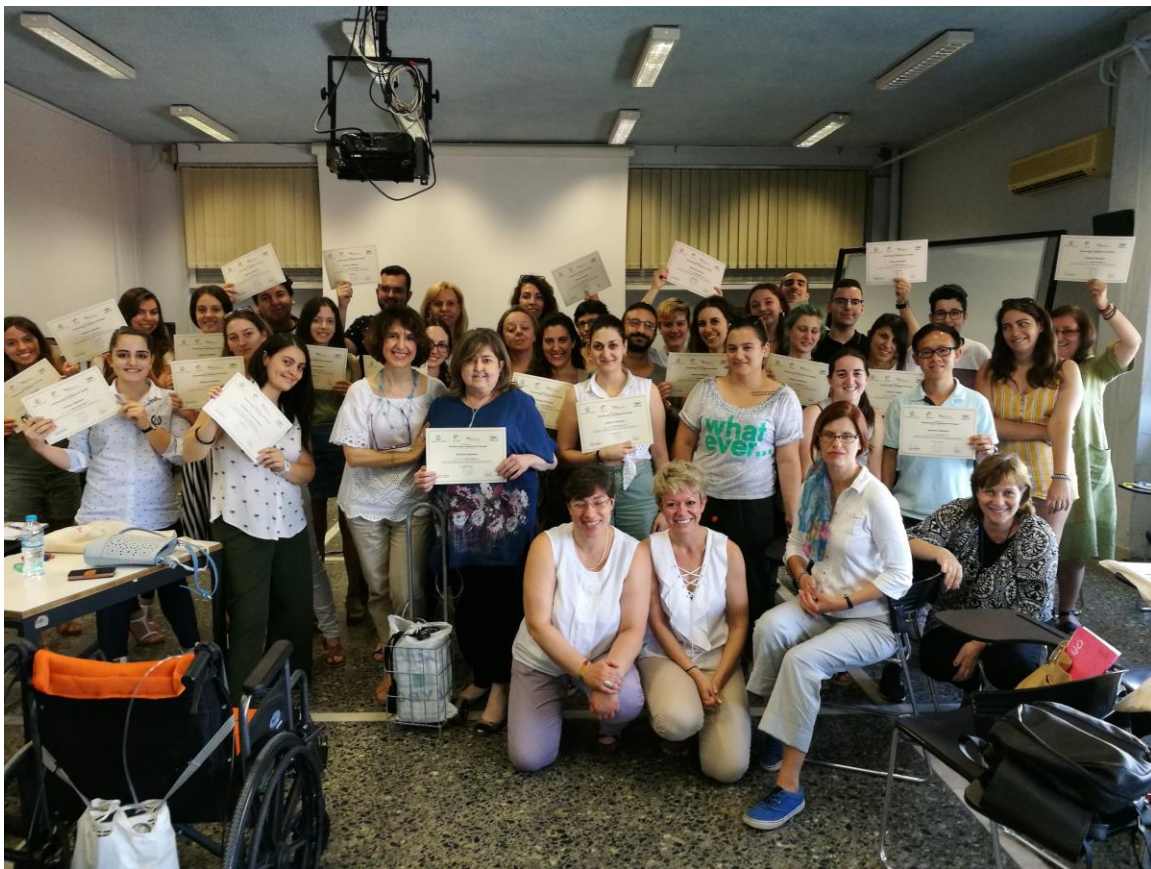
Summer School 2018 Graduation

http://www.enl.auth.gr/summerschool/2018-amlit/instructors.html